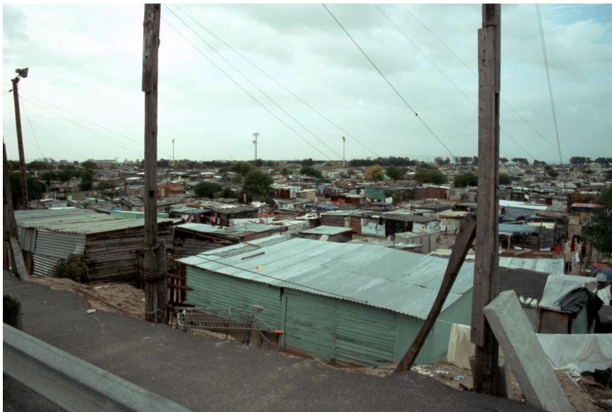
Photo 2. A new squatter settlement emerges on the outskirts of Indawo Yoxolo