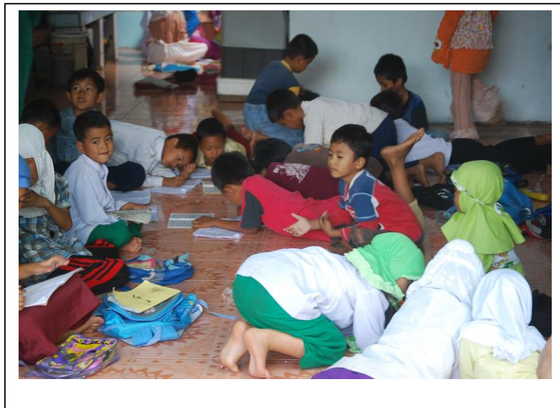
Figure 4.2. Children learning how to recite and write the Arabic alphabet at the Quranic learning center located in Kampung Baru.

government. Families who have someone who can teach the Quran often establish centers of learning, not only for their family members, but also for other children in the neighborhood. Since the 1960s, mosques have gradually transformed into the primary centers for Quranic learning, such as TPA ( Taman Pendidikan Alquran /Education center for the Quran) and TPSA ( Taman Pendidikan Seni Alquran /Education center for the Quranic arts). Subsequently, similar institutions were established in most of the mosques in West Sumatra. In the last two decades, reciting the Quran has also been taught in formal education institutions owned by private Muslim benefactors. This new subject has mainly been introduced in these private schools in order to attract new students. It should be noted, however, that this subject is an additional subject, to be taught alongside the religious education enforced by the government. This subject is set up for those students who do not have the ability to recite the Quran.