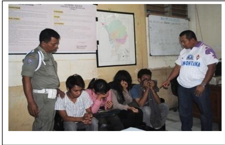
Figure 2.1. The two couples sitting on the bench have been accused of committing khalwa (Photo is printed in Daily Haluan , 08/06/2011).

During the inspection, Satpol PP firstly examines the identity of the suspected couple. If they are not married, they will be taken to the headquarters of Satpol PP .