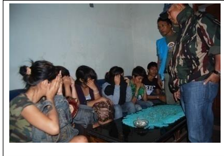
Figure 2.2. Six females and two males are being interrogated at the headquarters of Satpol PP

10/07/2010). On the whole, these cases are dealt with by the local law enforcement authority and only a few cases are forwarded to the police department.