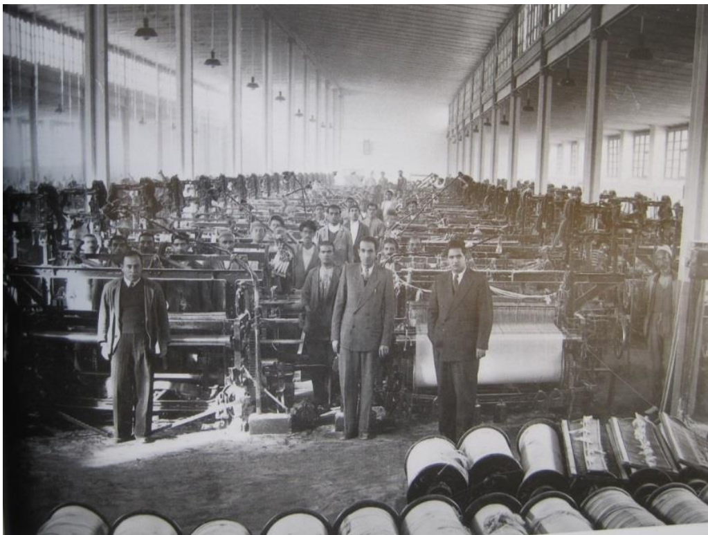
Figure 4: Interior of the Vatan Factory, Late 1920's.