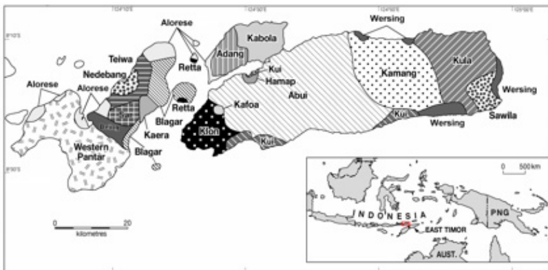
FIGURE 1. MAP OF THE ALOR-PANTAR LANGUAGES

In the literature, the Alor-Pantar languages have usually been discussed together with the Papuan languages of Timor and Kisar, to which they are surely related (see discussion in the following section). However, in this paper we restrict our attention to the reconstruction of Proto-Alor-Pantar (PAP), for two primary reasons. First, our data set for the AP languages is most robust, being based on several years of first-hand field work by the authors and colleagues. Second, while there remains much disagreement as to the nature of genetic affiliations between the Timor-Kisar and the Alor-Pantar languages, it is clear that the latter form a well-defined group. Lexical correspondences are abundant and more or less regular, and there is much shared grammatical structure. In contrast, the Timor-Kisar languages reflect significant lexical and grammatical influence from neighboring Austronesian languages. This situation largely reflects a distinct sociolinguistic history in Alor-Pantar. Until the modern era, only a single Austronesian language, Alorese, managed to get a foothold in the Alor-Pantar archipelago, and Austronesian speakers never settled