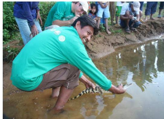
Figure 2. Releasing a head-started Philippine crocodile in the newly created Diwagden Lake, 2007.

In an attempt to give some indication of survival rates of wild (non-head-started) hatchlings, 36 hatchlings from five nests situated in various habitats (adjacent to creeks, ponds and fast-flowing rivers) were monitored during one year after hatching between 2000 and 2006 through quarterly surveys (van Weerd et al. 2006).