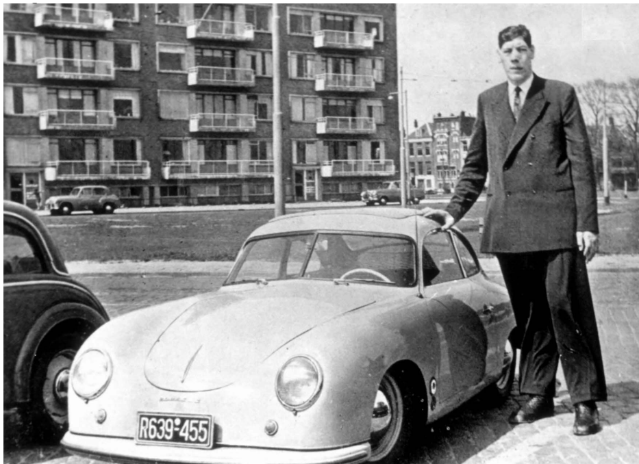
Figure 1. Dutch giant

Various treatments have been proposed for acromegaly from the 20 th century onwards. The first transsphenoidal operation was performed by Herman Schloffer (Austria) in 1907 and