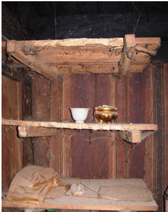
Illustration 2 Incense-burner in Jinping County 金平縣, Yunnan.