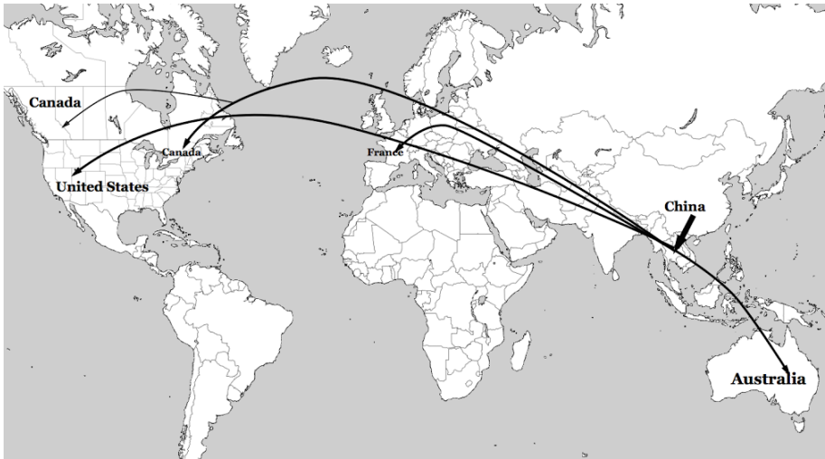
Map 2. 'Yao' Migration 30

history of the Yao in China merits special attention, a case I shall argue in the pages that follow.