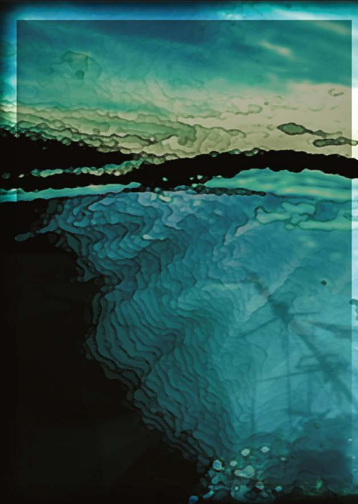
Aria of the Dutch North Sea