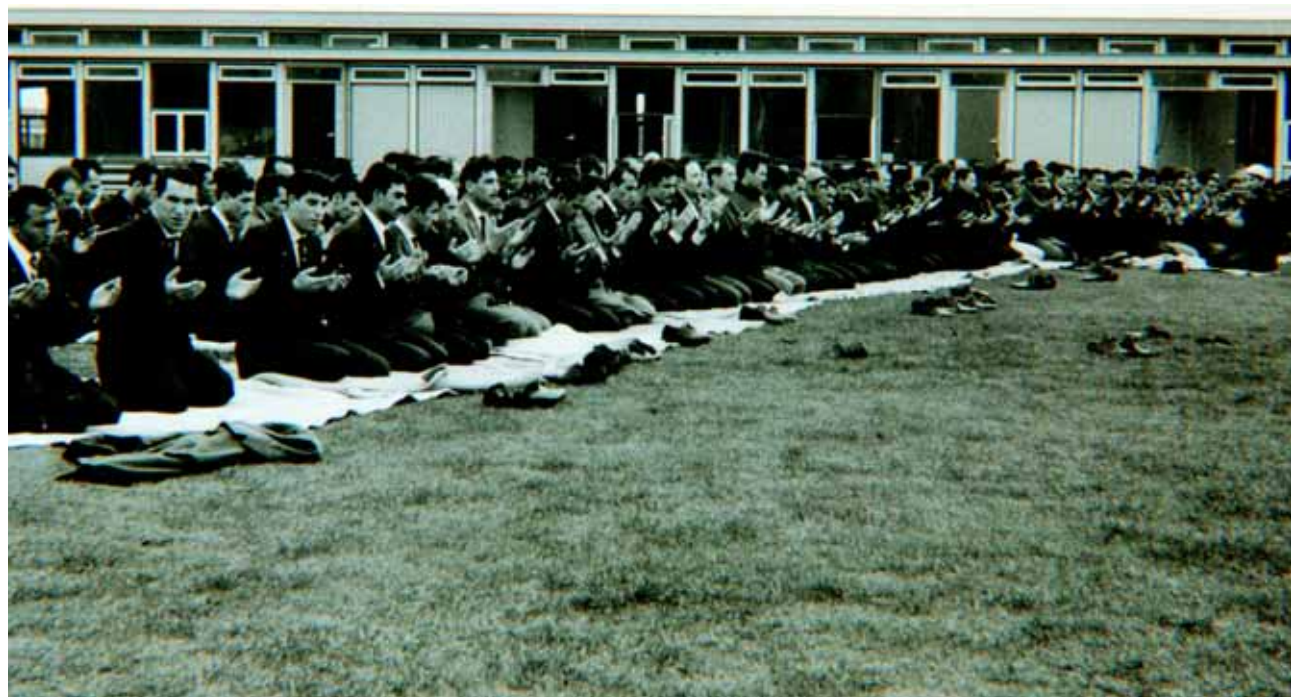
Turkish guest workers celebrating Ramadan (Seker Bayrami) in the Anadolu camp in Waddinxveen, around 1966.