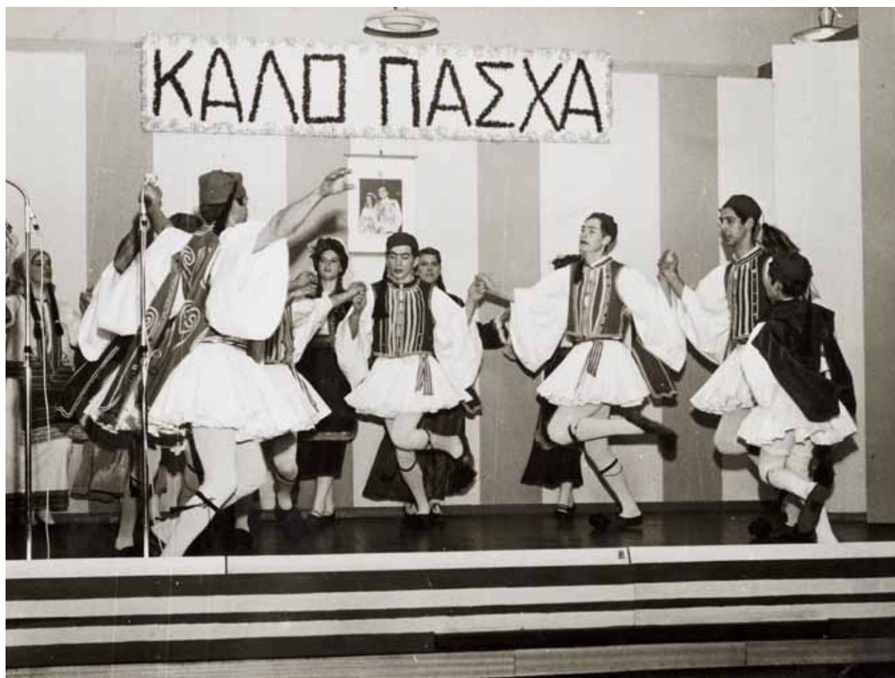
Organisations of migrants could get subsidies if activities were presented as 'cultural' and 'authentic'. State Mines in Heerlen: performance by dance group Pegasus (Pigasos) in the province of Limburg, the Greek for Happy Easter in the background, April 1968.