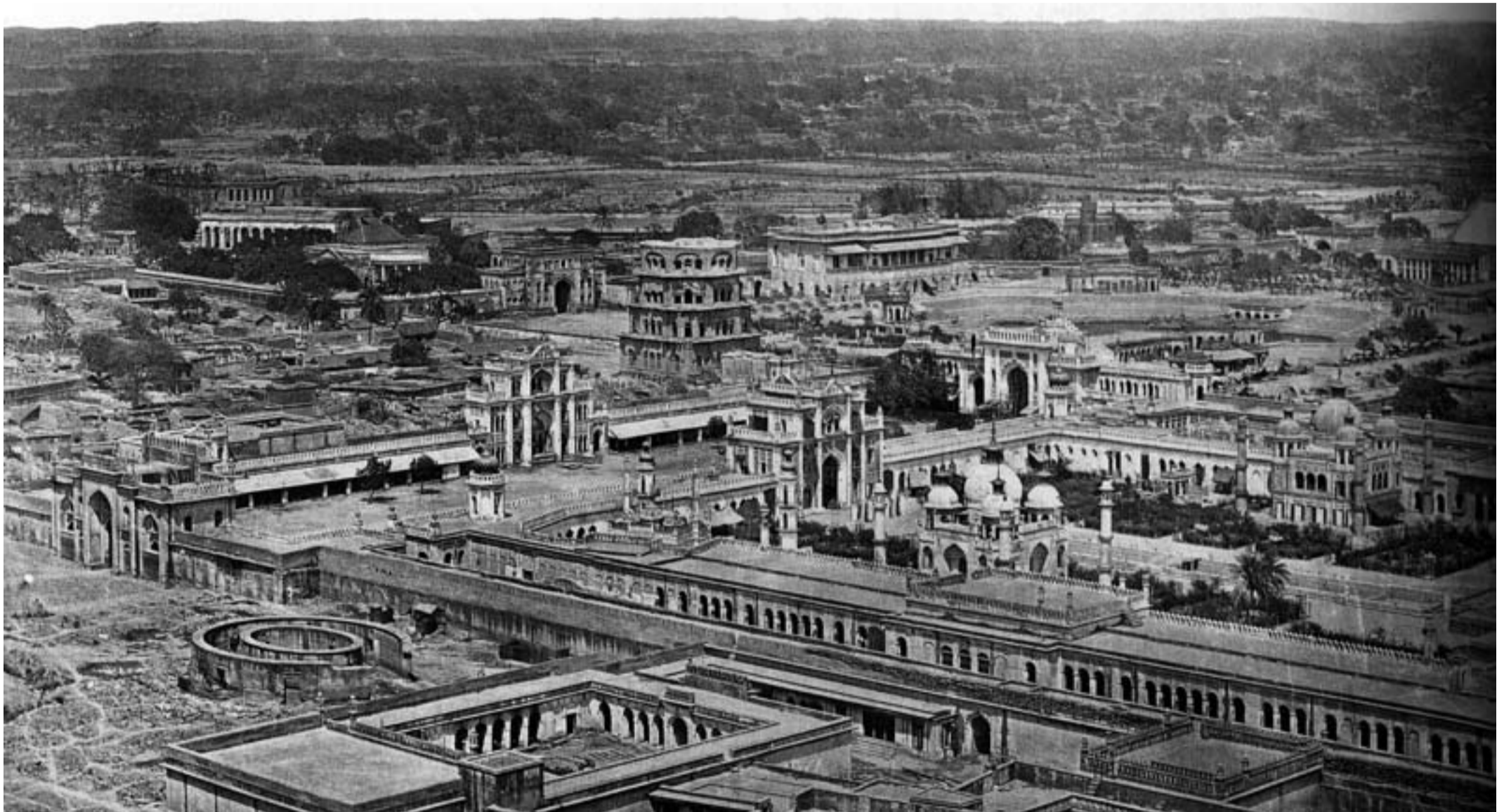
Felice Beato, albumen print 1858. Panorama of the Husainabad Imambara, Lucknow. The Alkazi Collection

Llewellyn-Jones, Rosie. ed. 2006. Lucknow: City of Illusion : New York, London, New Delhi: Prestel and the Alkazi Collection of Photography. 296 pages, ISBN 3 7913 3130 2