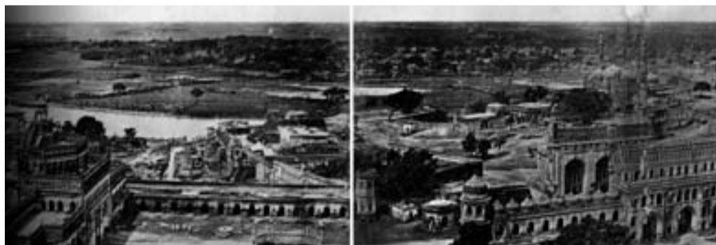
Felice Beato, albumen prints 1858. Four albumen photographs from a set of eight views taken from one of the minarets of the Asafi Mosque, Great Imambara, Lucknow.