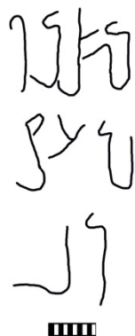
Figure 6: Drawing of inscription 3 (drawn by Zeyad al-Salameen)