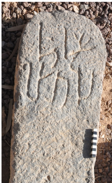
Figure 9: Photo of inscription 4