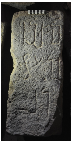
Figure 7: Photo of inscription 3