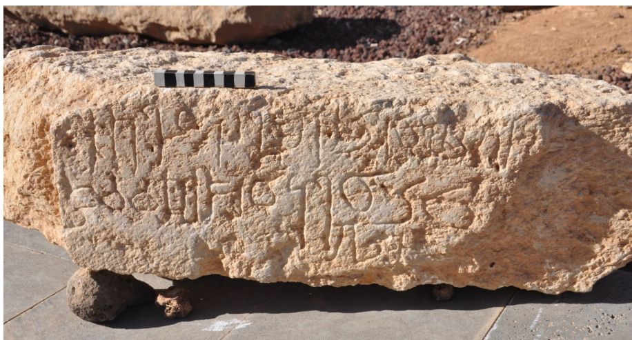
Figure 3: Photo of inscription 1