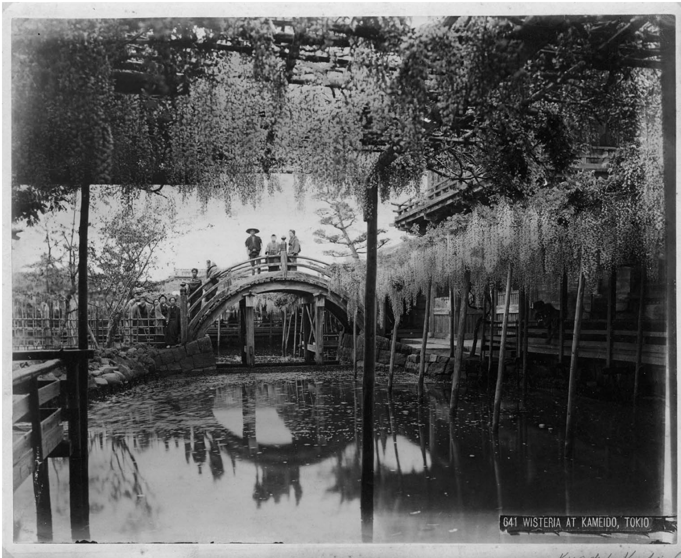
Fig.1 - Kusakabe Kimbei, 641 Wisteria at Kameido, ca 1860-1900 Hand-tinted Albumin Print, 21.3 x 27cm Collection of Arthur M. Sackler Gallery, Smithsonian Institution Views such as this beautifully coloured image of wisteria in bloom over a pond on the grounds of a Tokyo temple, with people standing on a gracefully arching bridge in the background, were mass produced and collected by tourists from all over the western world.

Early Japanese photography – like so many other elements of Japanese modernity – has often been considered a mere by-product of interaction between western technical know-how and traditional Japanese aesthetics. Academic approaches to understanding the photography of Meiji Japan (1868-1912) have likewise been hampered by what could be called an isolated aesthetics, where images are divorced from their social context even as they are mined for ‘evidence’ in what they purportedly tell us about Japanese history or customs.