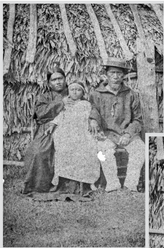
Fig.2 - Matsuzaki Shinji, Portrait of a Family, 1875