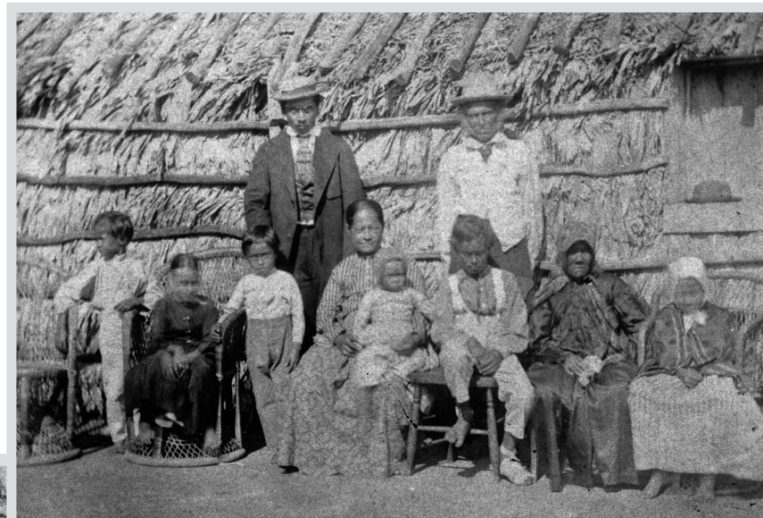
Fig.5 - Matsuzaki Shinji, Portrait of Bravo Family, 1875