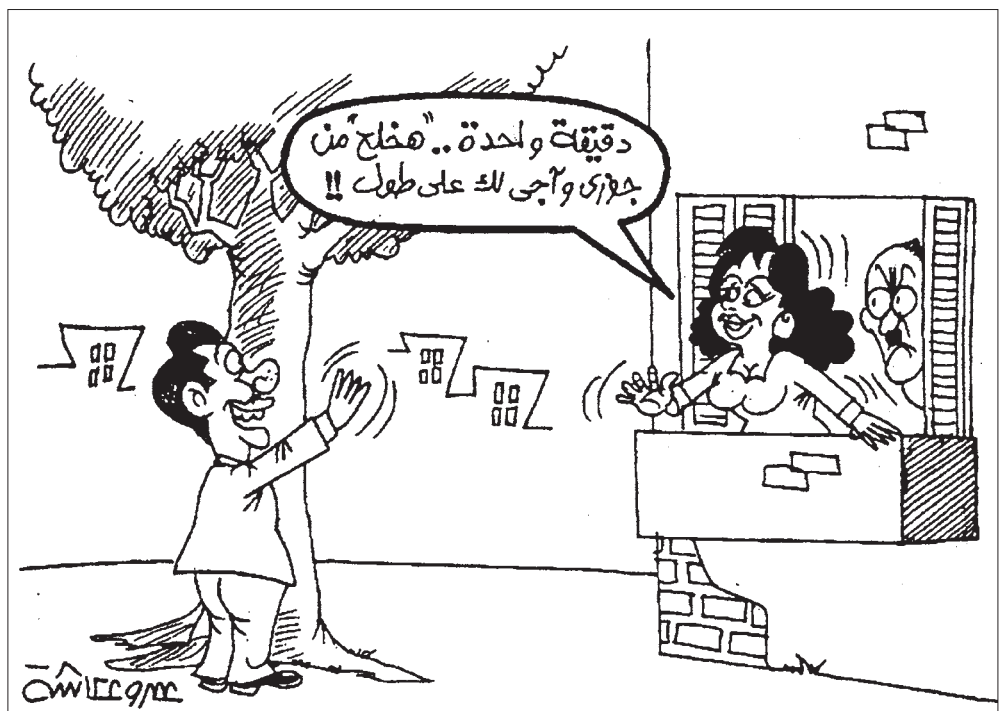
AL-WAFD NEWSPAPER, 2000

A woman tells her new lover: "Just a minute please... I will divorce my husband (through khul' ) and come to you immediately!" Al Wafd Newspaper, 8 February 2000