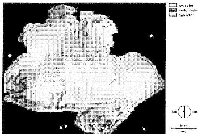
Figure 3. Middle Palaeolithic sites on the slope map from the Central Plateau.