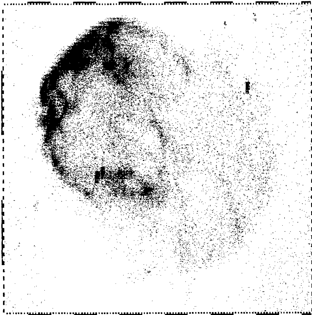
Figure 1. The 49 cm map of IC443.

One aspect of the project is to search for small scale radio spectral index and polarization variations to investigate the particle acceleration mechanism and magnetic field structure. Another aim is to study how SNR interact with their environment. Neutral hydrogen cloudlets associated with IC443 which were discovered by De Noyer (1978) are being investigated in greater detail. We also hope to study how the SNR shock affects an adjacent molecular cloud by observing the expected IR emission. In several intermediate age remnants it should be possible to examine the dynamics using high resolution optical spectra of their filaments. Finally, we plan to map the hot thermal gas through the soft X-ray emission from several remnants to further clarify their evolutionary state and the prevailing physical processes.