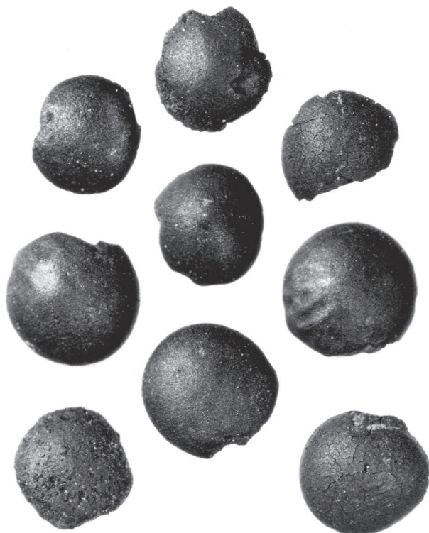
Figure 6.2 Lentils ( Lens culinaris ), 10 x

40-073, 57-020, and 57-041. Two belong to the late period of occupation, local occupational phase 6: 18-055 and 40-67C. And one, 34-041, could not be dated with certainty. Because pits belonging to the early period are more numerous than pits belonging to the late period, the ratio of two to four cannot be regarded as proof of a decline in lentil growing. It is quite possible that the dating of the last occupation is not precise enough for this kind of analysis. Another possibility is that the disappearance of lentil had no climatological background.