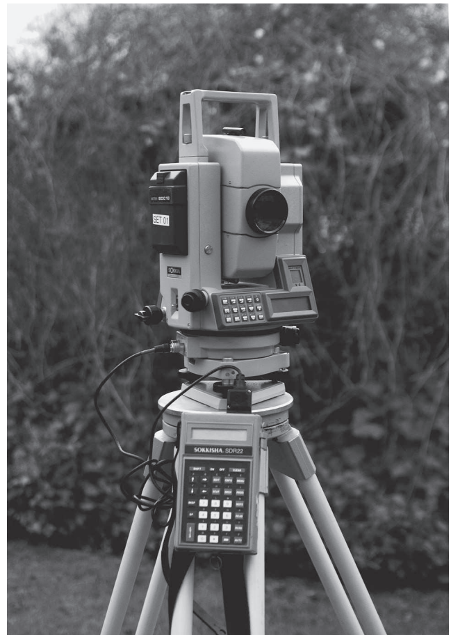
Fig. 2.1 A Sokkia total station set 4B with a survey data recorder (SDR).

The work procedure for the experiment was as follows: We followed the contour of the trenches and the features and made the site plan without tape, measuring stick, paper and