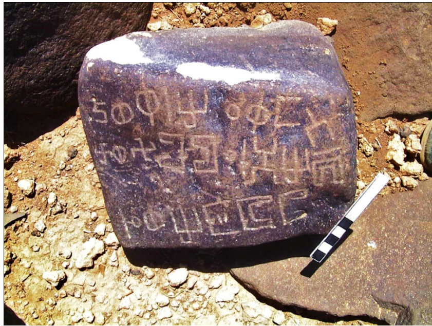
Figure 1: Photograph of the inscription