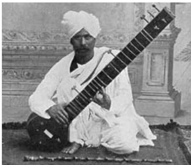
Sitar player.