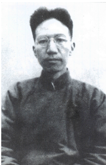
Chen Yinke, Hongkong 1941.

Chen's view of history is thus a form of idealism, albeit qualified by his emphasis on the particular manifestations of abstract ideals. The specific contents of these ideals vary from culture to culture, manifesting themselves in different ways in history. Hence, the ideals and their corresponding culture cannot be integrated into world history by general schemes of evolu-