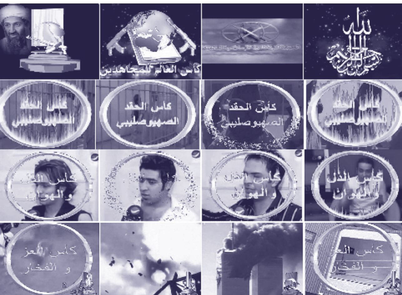
A combo picture grabbed from a video posted on internet by the Global Islamic Media Center (GIMC), 23 June