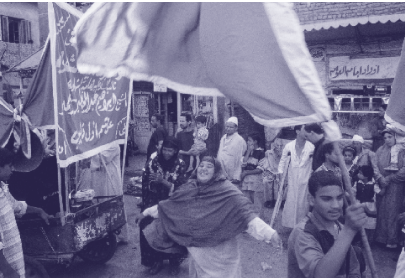
Procession at a mawlid festival in Qalyub, Egypt