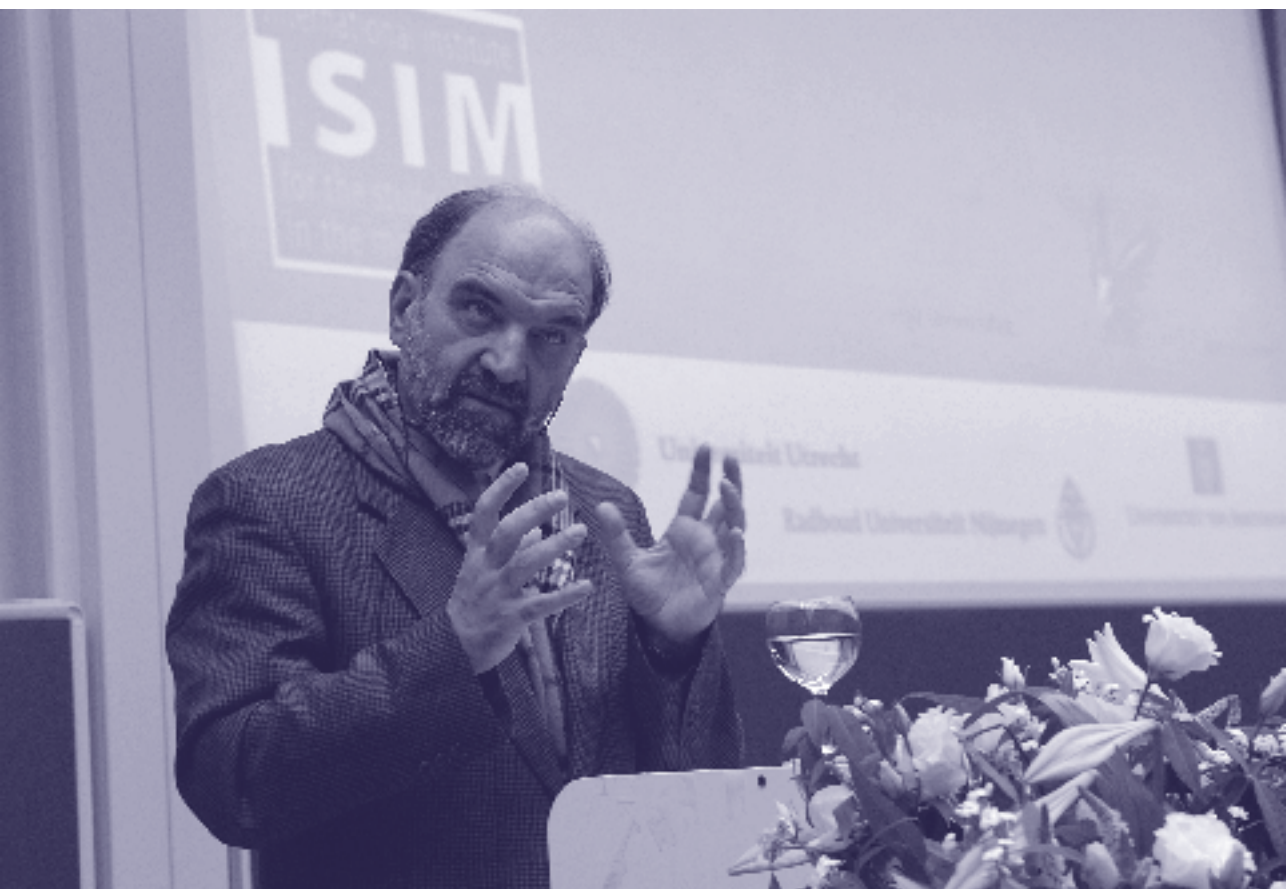
Abdolkarim Soroush, VU University Amsterdam, 7 December