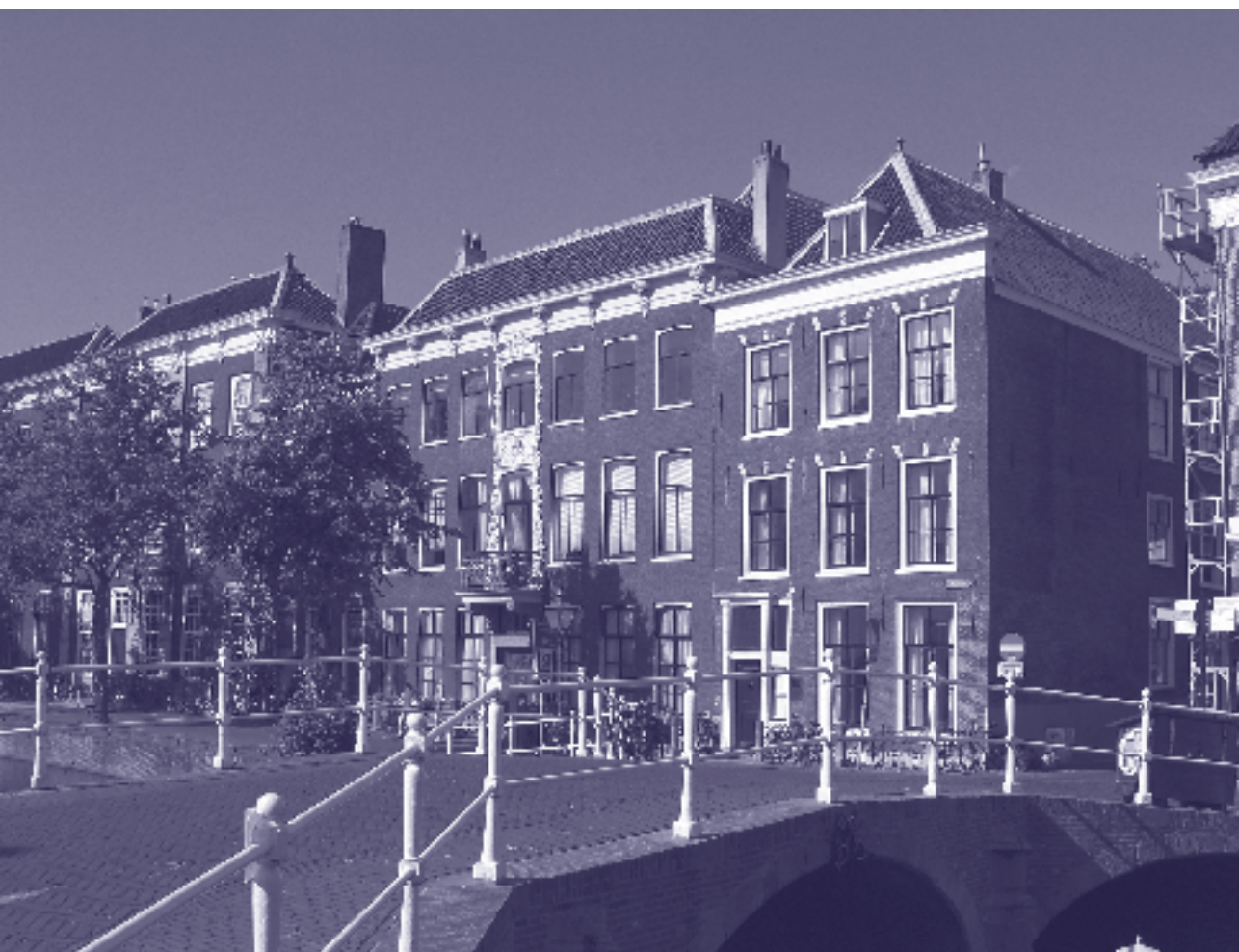
Rapenburg 59 (corner building), Leiden