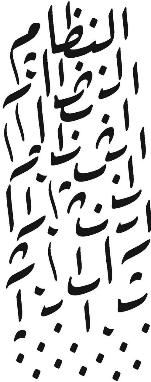
Illustration 2 The Stroke, designed by Lara Captan.