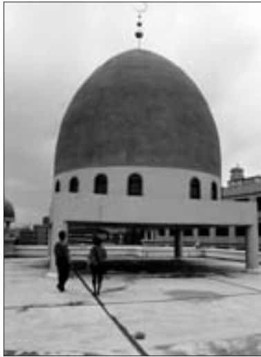
Domed mosque, Shanghai