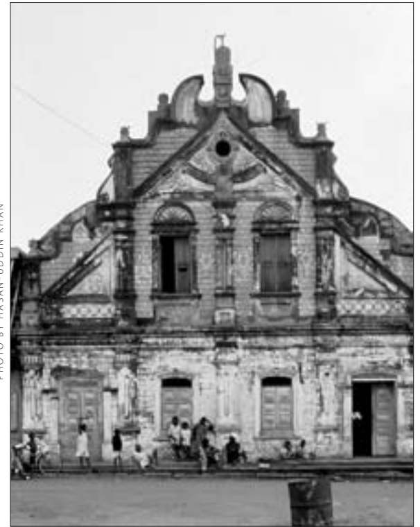
Community mosque, Aborney, Benin

ments. Is it apparent as a mosque? For some it is not. Some fifteen years after its completion the architect met with the clients and users of the project who said that they wished the mosque had had a minaret and dome so that it could be “perceived” to be a mosque.