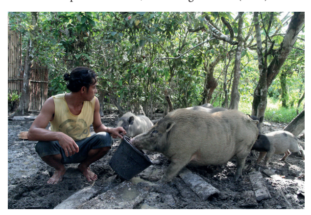
Domestication of animals, such as pigs, was supposed to reduce hunting pressure on primates on Siberut.

In the early 1980s, in addition to Survival International, WWF started to be active on the island because of the large-scale logging operations and the threats to the endemic primate species in particular. But the logging continued and relatively little progress was made in terms of real nature conservation or as WWF's report was called, in 'Saving Siberut' (1980).