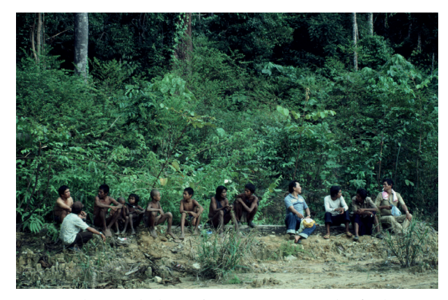
Orang Rimba in Jambi discuss forest management with officials.