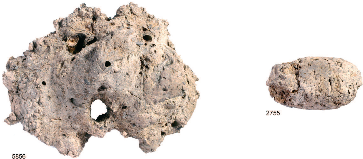
Figure 17.1 Examples of coprolites. No. 5856 type a, no. 2755 type c (scale 1:1).

All the finds recorded as coprolites (N=194) were assessed. Seven finds were rejected. The remaining 187 specimens were coded by BIAX Consult on the basis of the following variables: fragmentation, dimensions, shape, large inclusions. The coprolites were not weighed, as the weight of such finds is greatly dependent on the state of preservation, and hence not very suitable as a criterion for identification