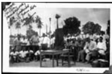
Makhhan Singh addressing a rally, 9 Sept 1962.