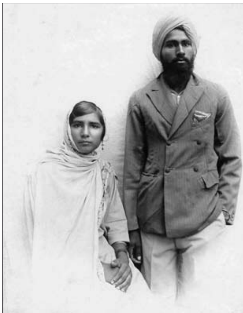
By Gopal Singh Chandan. c 1932. Nairobi