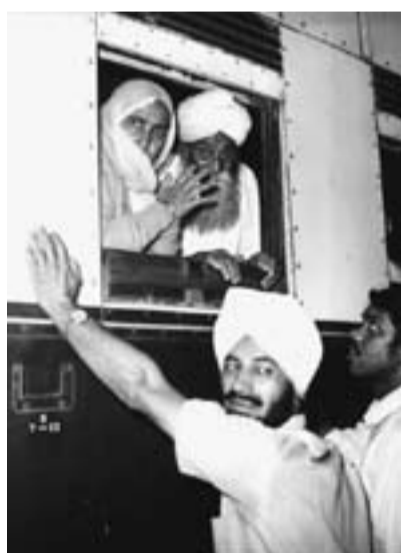
By Mohammad Amin. Nairobi. 1965.