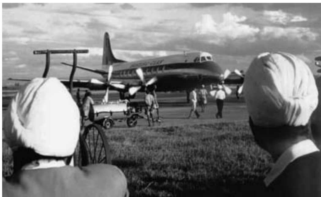
Eastleigh Airport. Nairobi. 1957.