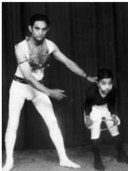
By Gopal Singh Chandan, Nairobi. © 1932.