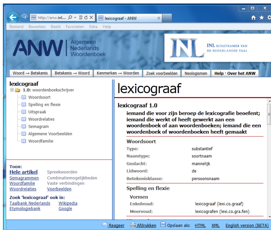
Figure 1: The entry lexicograaf ('lexicographer') in the ANW

The ANW can be accessed for free via http://anw.inl.nl . This website shows a list of numbers and letters on the left and a search box on the right. If a word is typed in the search box, a list of results appears. The required entry will be opened by a click on the word which is searched for.