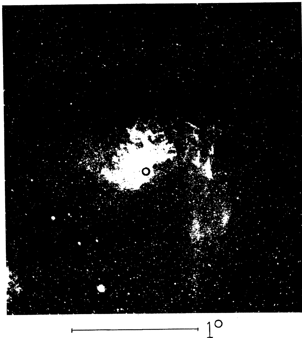
Reproduction of SHAJN and HASE's photograph in H \alpha of the emission nebula IC 405 around the star HD 34078 (AE Aurigae), which is marked by the circle in the centre of the figure. North is up, East to the left. The scale is indicated below.

of the HII region south west of HD 34078 – the "uncleaned" part that is left of the original cloud – indicates a density of about one tenth of this value. Accurate photometry of the emission nebulae is required in order to improve these rough estimates.