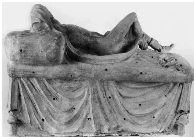
Figure 7 Terracotta 'sarcophagus' from Tuscania (from Sannibale 2009).

The last indication of a ritual in honour of Atunis is a funerary terracotta monument which looks like a sarcophagus, representing a wounded Atunis accompanied by his mourning hunting dog (c. 250-200 BC). It never contained a corpse or ashes, however, since the bottom has openings. It was found in a necropolis of Tuscania, a city belonging to the territory of Tarquinia. It has many little holes in the back (fig. 7) and sides. Sannibale (2009) presumes that the holes were used for the evaporation of gasses during the baking process. Torelli (1997, 233-4) suggests, without however offering any supporting arguments, that twigs were inserted into the holes. An Apulian red figure pelikè , dated to c. 330 BC, depicts