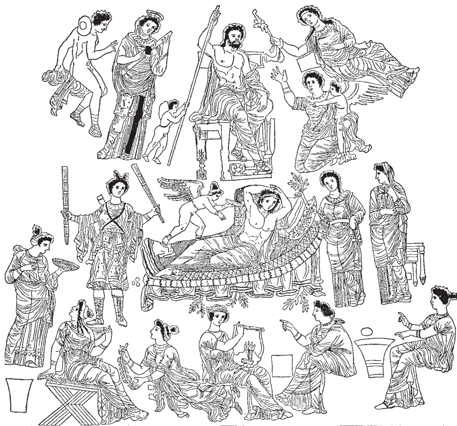
Figure 8 Apulian red figure vase (from Berger-Doer 1979).

Adonis (labelled) lying on a bed, threatened by a Fury with a torch, foreshadowing his imminent death (fig. 8). Reversed twigs are sprouting from under the bed, which suggests