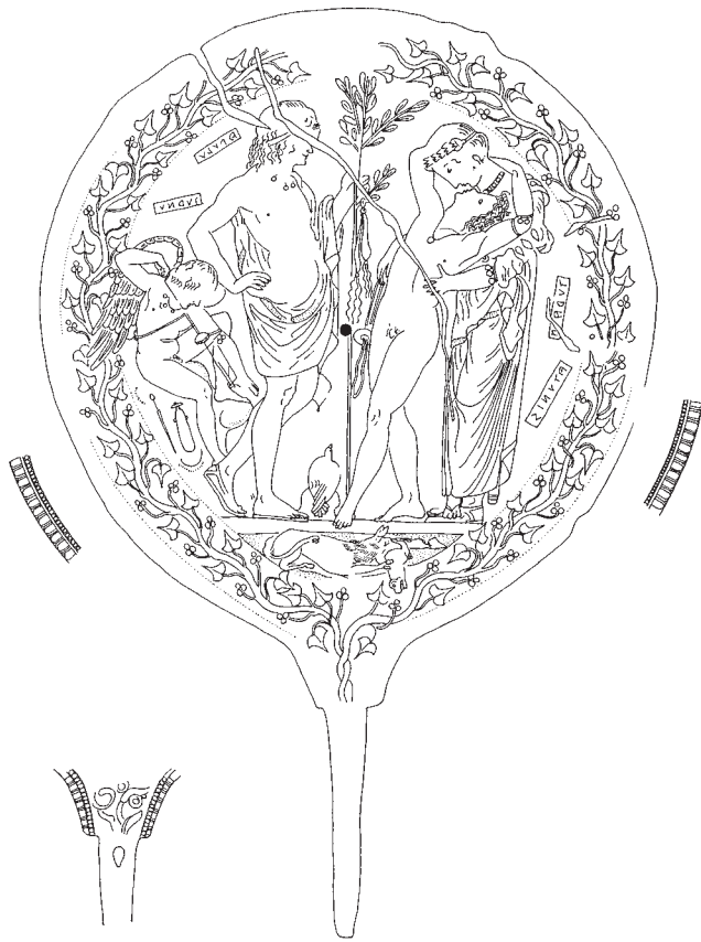
Figure 3 Mirror no. 20 from Castel Viscardo (from Feruglio 1997).

ivy-leaf border decoration were produced in the fifth and fourth centuries BC.