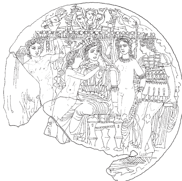
Figure 6 Mirror no. 17 showing Atunis on Turan's knee (from CSE BRD 1, 39).

Several objects, like the bed (nos. 6, 18), chair (1, 12, 17, 19), mirror (12), or cista for alabastra (5, 12) set the meeting between Turan and Atunis in a domestic context. Most interesting is no. 17 (fig. 6), which shows columns. Architectural backgrounds are frequent on mirrors of the second half of the fourth century BC, and are clearly an Etruscan addition (Wiman 1990, 147-149). Some mirrors showing the Oracle of Urphē/Orpheus (no. 8) have such