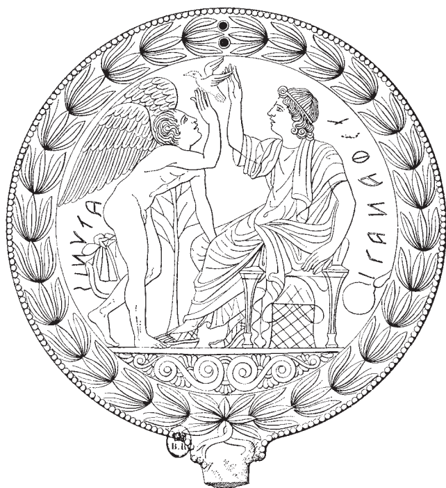
Figure 4 Mirror no. 12 showing Atunis and Turan ati (from Atallah 1966).