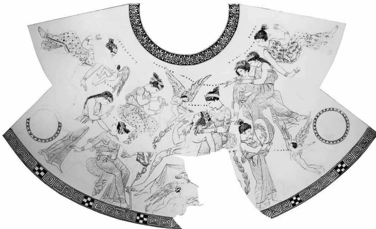
Figure 2 Hydria of the Meidias painter, drawing (from Burn 1987).