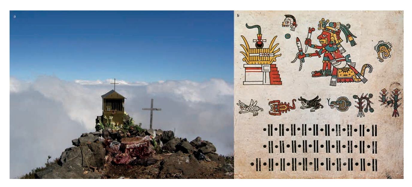
Figure 4 Left: traditional Mixe altar with offerings today on the sacred mountain Zempoaltepetl. Right: offerings of bundles of 11 fir needles or flowers, laid out in two rows of 10 and one row of 11 on an altar for a Deity of Light on the day 1 Death, together with burning fire wood, against harm and dangers symbolized by thorns and biting or stinging animals - Codex Tezcatlipoca (Fejérváry-Mayer), p. 5.

data (the calendar and its symbols) as well as to the authority of tradition and world-view, lends a sense of 'objective' value to the message and the vision of the future, removing it from purely subjective guesswork. This is reinforced by the ritual acts and ceremonial speech (cf. fig. 4), which may involve special mnemonics, including phonetic or other associations, as may be observed in several contemporary cases worldwide (cf. Tilley 2000; Zeitlyn 2001; Hatfield 2002; Keane 2004).