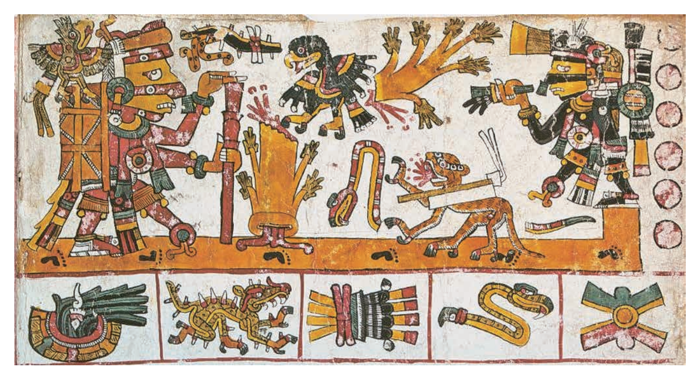
Figure 2 Codex Borgia, p. 21: In this period, indicated by the days [3] Water, Alligator, Reed, Serpent and Movement and six following sets of days, the merchant carrying precious goods (quetzal bird) travels under the auspices of the deity Red Tezcatlipoca ("Smoking Mirror"). He may encounter bad luck: the tree (success, continuity, lineage, rulership) breaks; serpents and dangerous animals bar the road. A mysterious enemy (Black Tezcatlipoca) throws a burning stick with spikes at him.

From a comparative perspective we know that mantic texts tend to be fundamentally ambivalent and 'open', a quality created through the use of the literary, arcane language, full of metaphors. This brought us to consider the forms of Mesoamerican ceremonial discourse, e.g. the 'speaking in pairs' (difrasismos), present in early colonial documents and still alive in oral tradition.<sup>7</sup> It is precisely from this perspective that we have tried to read the images in the codices by connecting them to the historically documented and/or still living traditions. We have found that the very effort to read the scenes in terms of indigenous languages, metaphors and conventions of oral literature is a fruitful