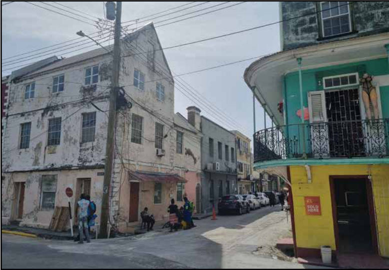
Fig. 2 One of the oldest brick buildings in Bridgetown (17th century), with a poorly thought out roof repair that has made the historic Dutch gable disappear from view (picture by De Waal, February 8, 2024).