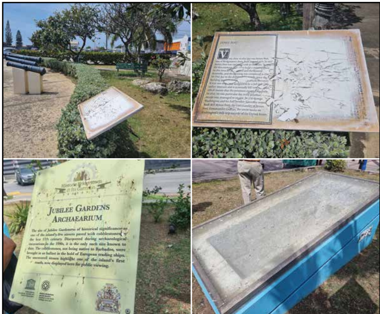
Fig. 5 Left and right above: historic elements and information panels in the park between The Wharf Road and the car park south of Princess Alice Highway. Left and right below: a preserved and displayed part of one of Bridgetown's late 17th century cobblestones streets at Jubilee Gardens (pictures by De Waal, February 8, 2024).