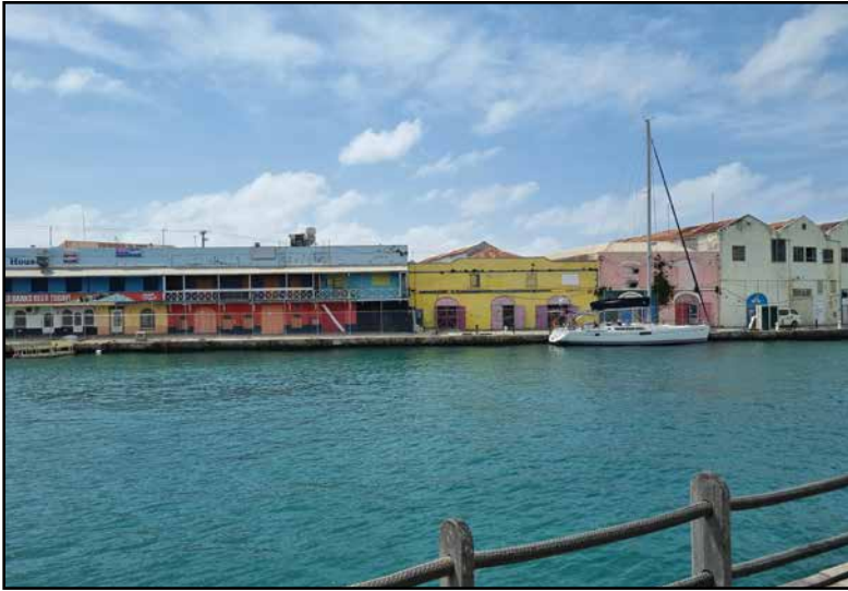
Fig. 1 Desolate and abandoned waterfront cafes and an empty carenage.

The participants consider it important to not keep the history stale but refreshing and highlight the lesser known stories. A central role is seen for the Barbados National Register of Historic Places in the Division of Culture and Barbados Tourism Marketing Inc. The Environmental Planning Group Inc.& HLA Consultants presented a listing of potential Barbados narratives by theme, focusing on the questions “What stories must we tell about Barbados” and “What stories would we be delightfully surprised to hear about Barbados?”. The resulting themes listed include Freedom & Resilience Stories, Laying the Foundations, Locals & Legends, Eat, Drink and Be Merry, Ten Fathoms & Maritime Exploits, The Story of Sugar, Nature’s Treasures, Sports in Bim, and Cultural & Creative Arts. 19 This list could be consulted as a starting point.