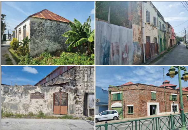
Fig. 3 Left above: One of the last remaining slave huts in Barbados (Hutson Alley, seen towards the west). Right above: Historic buildings in Suttle street (seen towards the west). Left below: Historic buildings in Pierhead Lane, with a direction sign towards the historic, and now inaccessible, screw dock area. Right below: 18th century Spirit Bond building at The Wharf Road (pictures by De Waal, February 8, 2024).