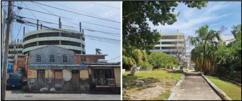
Fig. 4 Left: The City Central Mall car park towering over the traditional buildings in Suttle Street (seen from Reed Street, looking south). Right: The City Central Mall car park, dominating the view from St Mary's Church towards the east (pictures by De Waal, February 8, 2024).