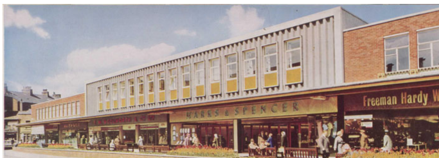
Figure 1—An early Arndale shopping parade in Accrington in the traditional industrial region of Lancashire, mid-1950s. Projects like this represented a significant reorganization of the physical and commercial landscape. Arndale was pleased to have attracted a number of national retail chains to Accrington’s “outstandingly successful centre.” Source: Arndale Property Trust, “Arndale in Partnership with Local Authorities,” 1966, RIBA, 711.552.1(41/42)//ARN.

high street. In an early indication of the public-private collaboration that would become Arndale’s hallmark, some of these developments were carried out as part of wider public planning schemes such as new road building (as happened at Headingley) or else were integrated with municipal facilities such as corporation markets (as at Lancaster). Whether or not they relied on such proactive public-private cooperation, the operation of the newly installed postwar planning system meant that all such projects had to secure approval from the local authority in the form of planning permission.