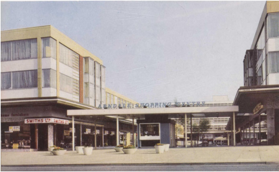
Figure 2—View of the principal access point to Arndale’s pedestrianized precinct development at Jarrow.