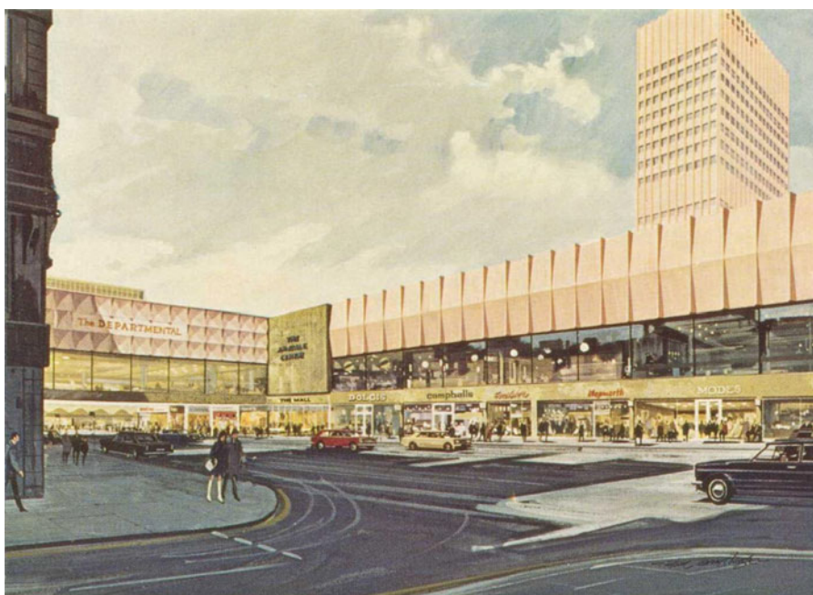
Figure 8—Artist's impression of the mammoth Manchester Arndale Centre, which overhauled a fifteen-acre expanse of the extant city center in the 1970s.

Europe, with over two hundred new shops, a nineteen-story office block towering over the city, a large new market, and “a bus station that will disgorge 40,000 passengers into the marble malls.” It was a sprawling and sophisticated piece of commercial infrastructure, with “miles of delivery and service areas under the main shopping level,” “armies of cleaners,” “a labyrinth of corridors and lifts,” “a 24-hour security system involving closed circuit television,” and “a team of security guards in radio contact with the main security room.” The operation of such a center was no simple task; it required sophisticated new management techniques and left large portions of the city’s central areas to be overseen and policed by commercial actors. One of the Manchester Arndale’s new managers described it as “a town within a city.” 110