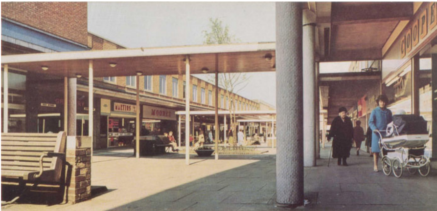
Figure 3—View along one Jarrow’s precincts, showing use of canopies, planting, and benches to “create a new environment” for shoppers. Source: Arndale Property Trust, “Arndale in Partnership with Local Authorities,” 1966, RIBA, 711.552.1(41/42)//ARN.

precincts create a new environment for the people” and “the townspeople and many others from the neighbouring communities now enjoy an up-to-date and exciting pedestrian precinct.” 21