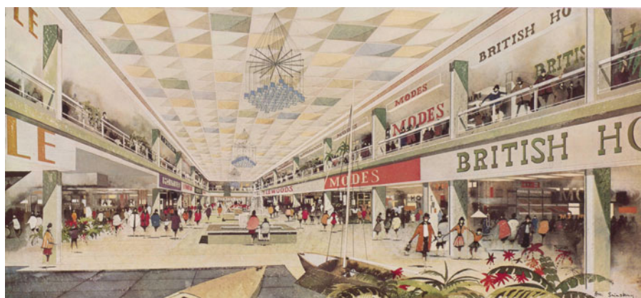
Figure 7—Artist's impression of the interior of the Doncaster Arndale Centre, illustrating the emphasis upon spectacle, novelty, and display. Lavish and intricate decor, exhibition, variety, and an assault of brand advertising dominate an environment that postmodern theorists would later dub hyperreal.

firmly prefigured later developments in urban space and experience, which would come to be placed at the heart of broad-based transformations in the culture and economy of cities by the later twentieth century.